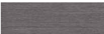
ST796 Nona, Tweed