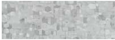
ST830 Geome, Calcite

Inspired by mosaic artisan techniques, Geome features a geometric pattern with subtle color shifts and Oxidize has an anodized metal look, similar to glazed ceramic. Both designs are available in 18 in. x 36 in. tiles.