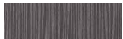
ST891 Atro, Tweed