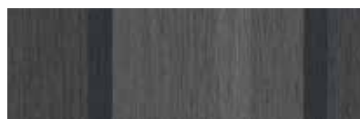
ST851 Decima, Tweed