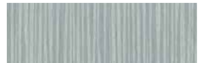
ST896 Atro, Cashmere