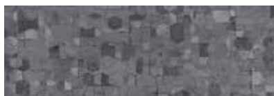
ST835 Geome, Obsidian