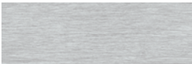
ST798 Nona, Silverdust