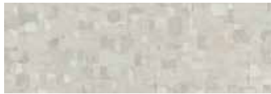
ST831 Geome, Sulphur