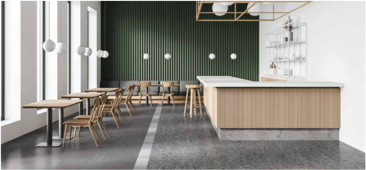
ST796 Nona, Tweed | ST855 Decima, Silverdust | ST834 Geome, Slate

Nona , Decima and Atro were designed as a trinity, each one with a unique, yet unified texture represented in neutral colors. Use them together or independently to create a unique space.