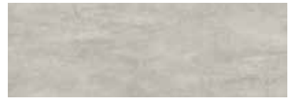
ST884 Oxidize, Rhodium