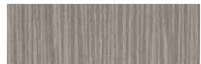
ST892 Atro, Ravenna