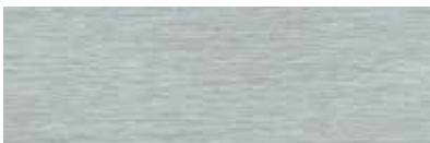
ST799 Nona, Cashmere