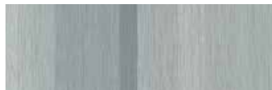
ST856 Decima, Cashmere