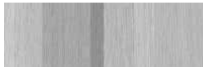
ST855 Decima, Silverdust