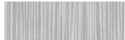
ST895 Atro, Silverdust