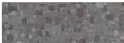
ST834 Geome, Slate