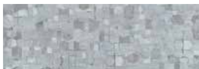
ST833 Geome, Azure