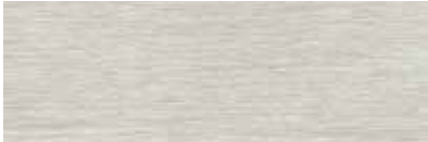
ST797 Nona, Valerie

Nona and Atro are available in 18 in. x 18 in. tiles and Decima in 6 in. x 36 in. planks.