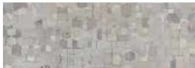
ST832 Geome, Dolomite