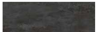
ST882 Oxidize, Vanta