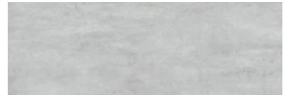
ST883 Oxidize, Platinum