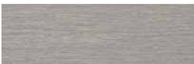
ST776 Nona, Ravenna