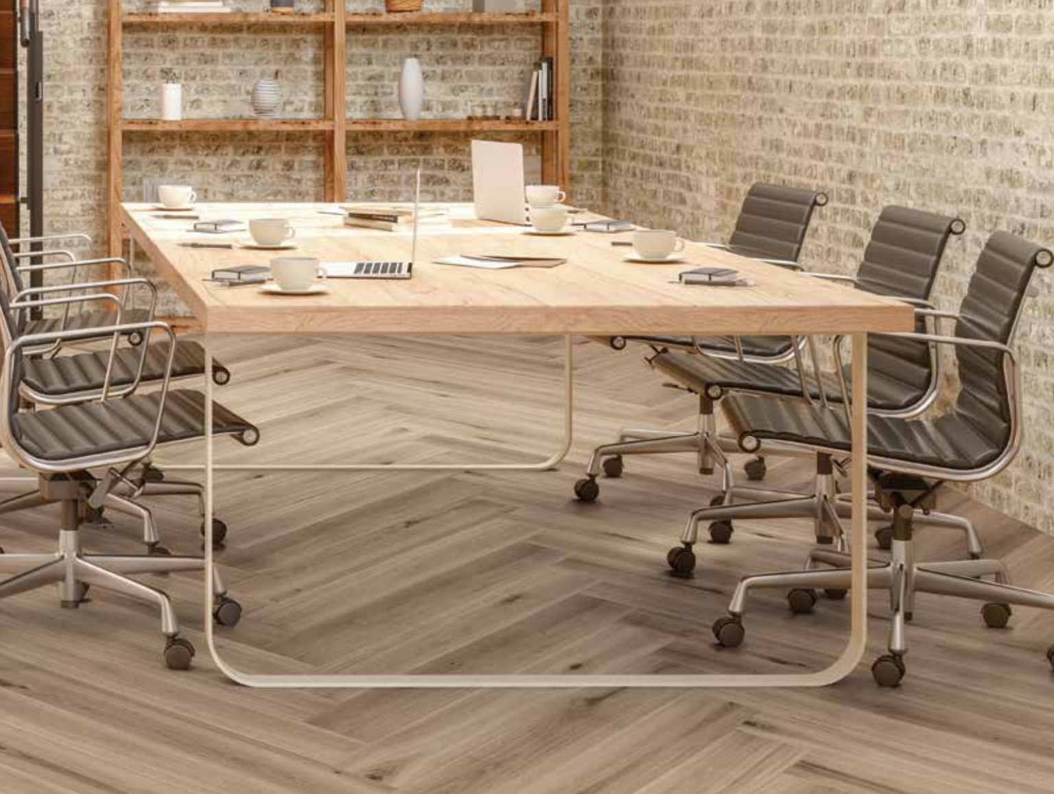
ST252 Montane, Kilimanjaro