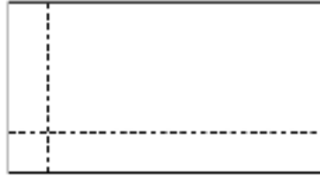
Fig. 2 Chalk lines.