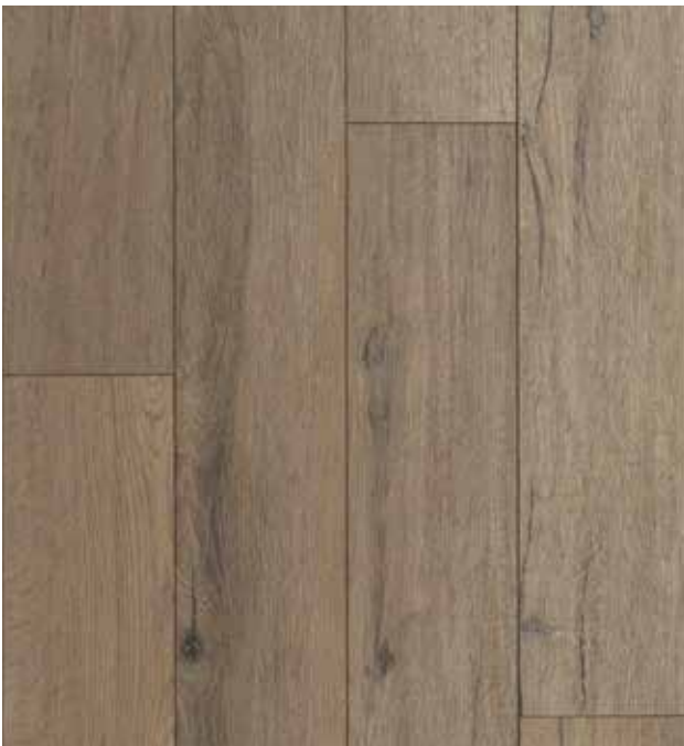
MOUNTAIN ASH SMOKED - 1P100079

Choose from Australian Species, European Oak and Mountain Ash designs. Scan this QR Code to see multiple plank images of all the PRYZM timber designs.