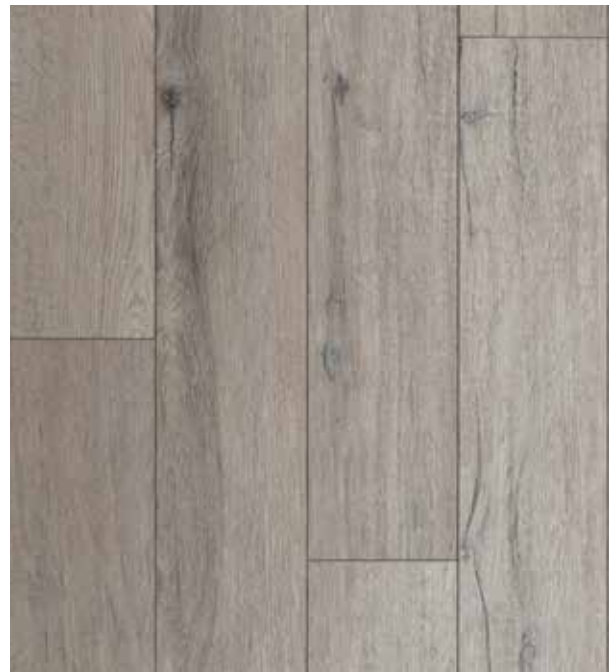
SEASPRAY MIST - 1P101033