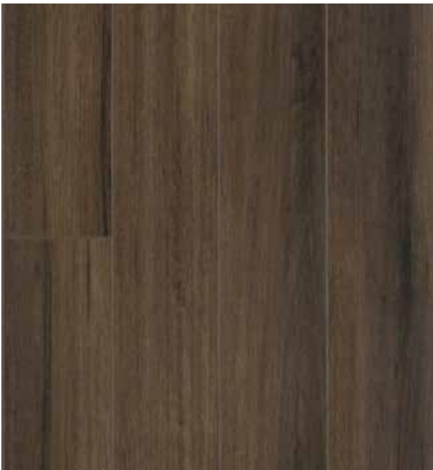
MOUNTAIN ASH AGED - 1P100088