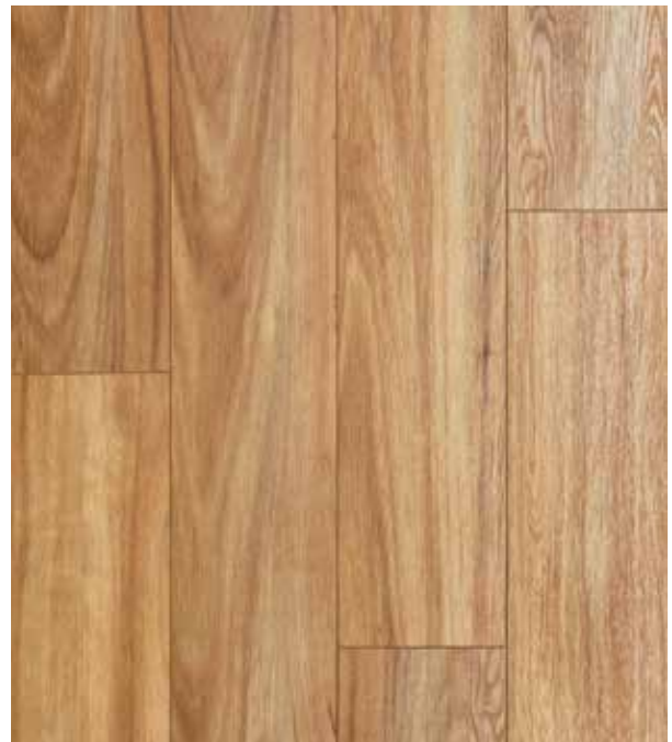
FLOODED GUM - 1P101236