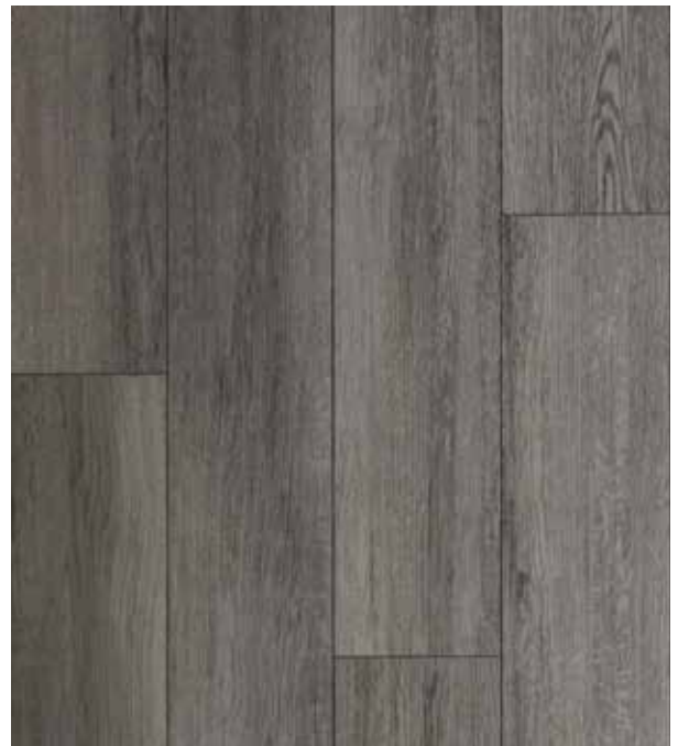
MOUNTAIN ASH CHARRED - 1P100077