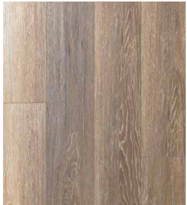
RIVERBANK OAK - 1P101192