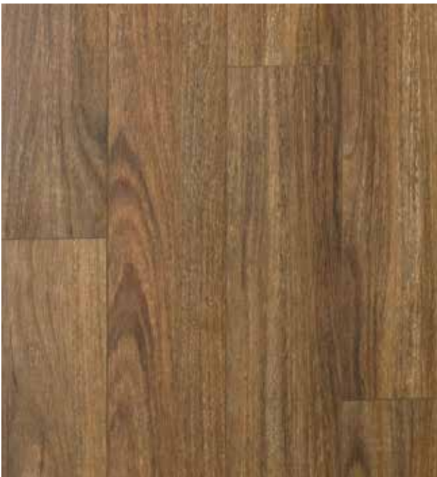
COASTAL SPOTTED GUM - 1P101238

PRYZM delivers chic, realistic timber looks never before seen on such high performance floors. Elevate the spaces within your home using traditional and on-trend styles, combining a natural appearance with an embossed texture and micro-bevelled edges for added realism.