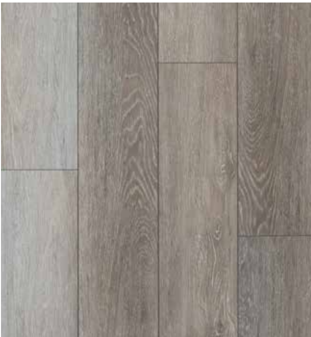
OCEANSIDE OAK - 1P101193