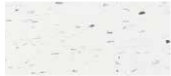
51941SZ Polar White