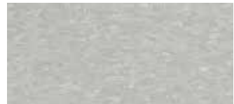
51861SZ Soft Warm Gray