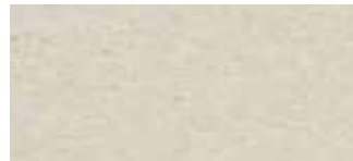
51810SZ Washed Linen