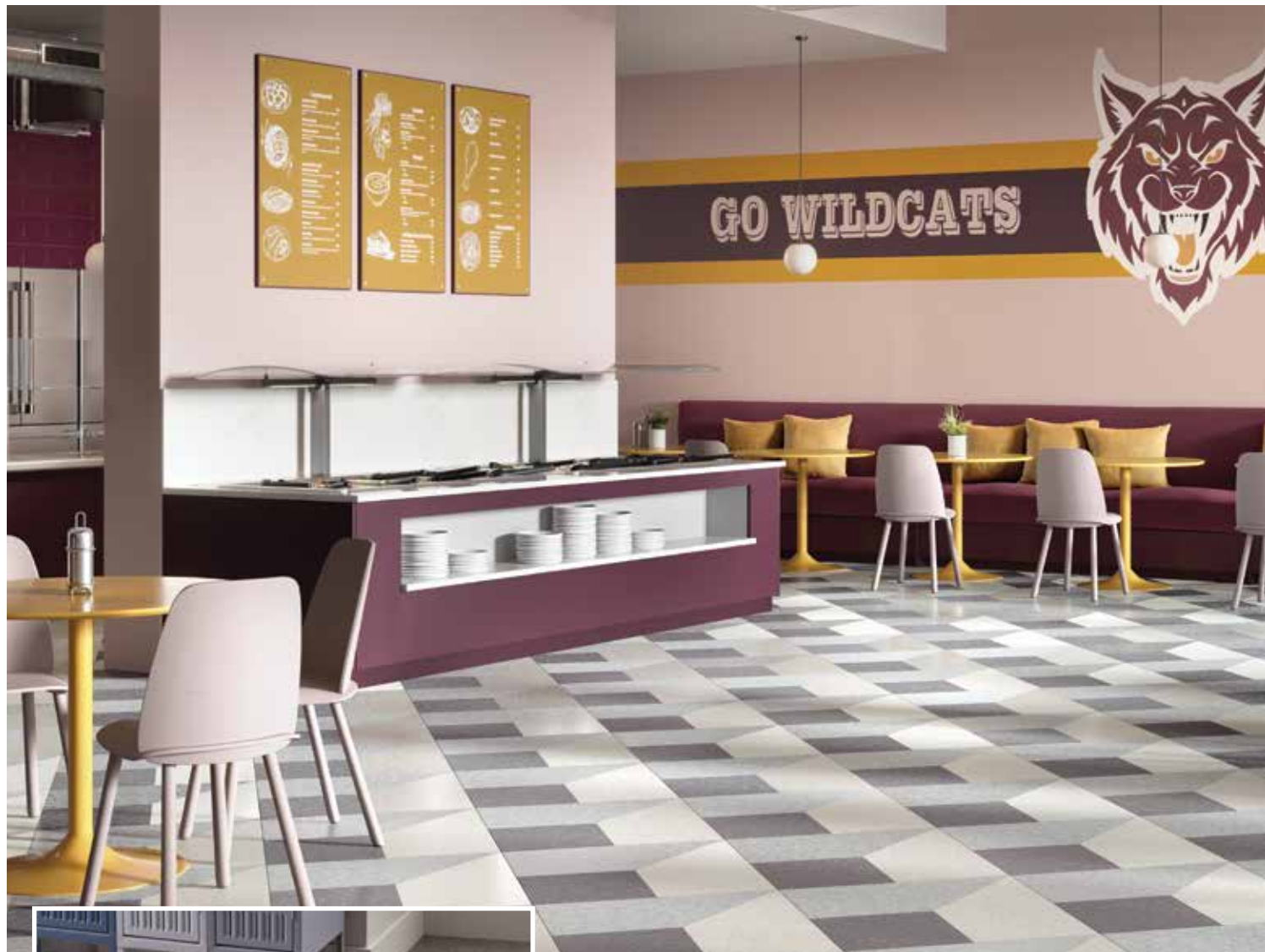
Safety Zone Tile is installed in front of the salad bar. | 51861SZ Soft Warm Gray, 51915SZ Charcoal, 51903SZ Blue/Gray