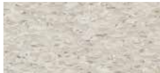
51836SZ Shelter White