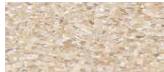
51830SZ Cottage Tan