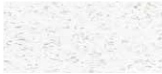
51899SZ Cool White