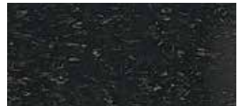
51910SZ Classic Black