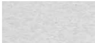
51860SZ Soft Cool Gray