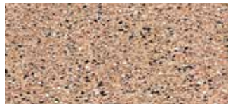
57008 Soft Cedar