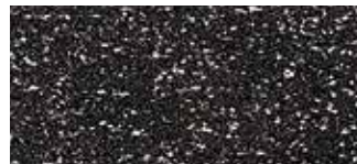
57004 Slate Black

Add 10 years of overall warranty coverage by using Strong System™ subfloor preparation products. Visit ArmstrongFlooring.com for more information.