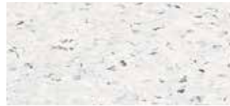
52513SZ Cirque White