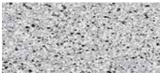
57001 Shale Gray