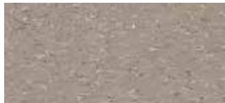
51804SZ Earthstone Greige