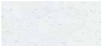
51933SZ Blue Cloud