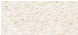
51839SZ Fortress White