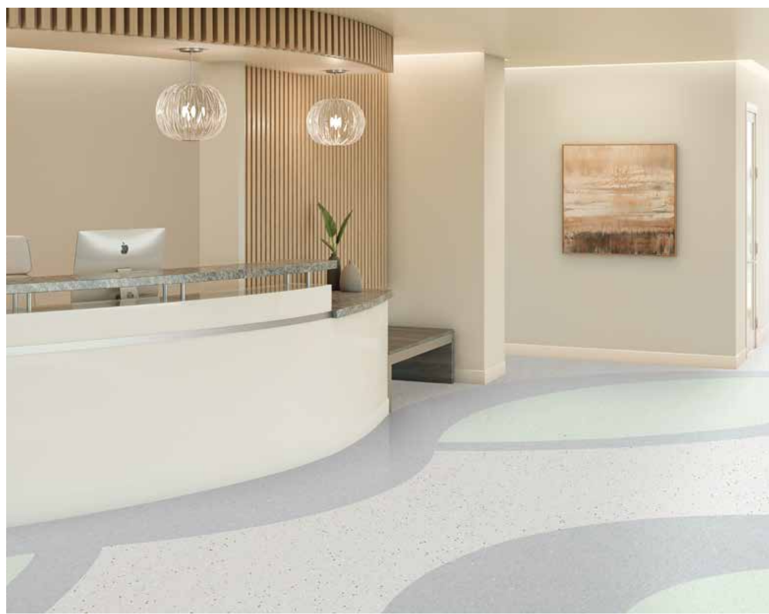
H2006 Calming Gray, H2027 Cedar, Natralis: 70001 White Rim