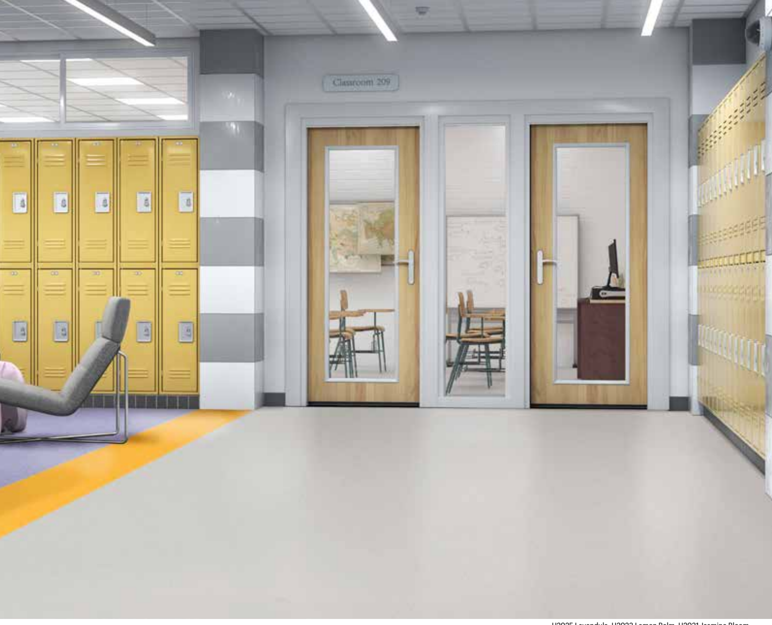
H2025 Lavendula, H2023 Lemon Balm, H2031 Jasmine Bloom