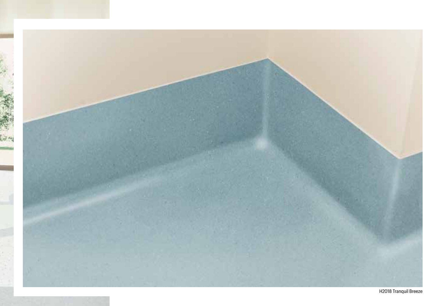
Superior infection control with heat welded seams for spaces demanding enhanced sterilization.