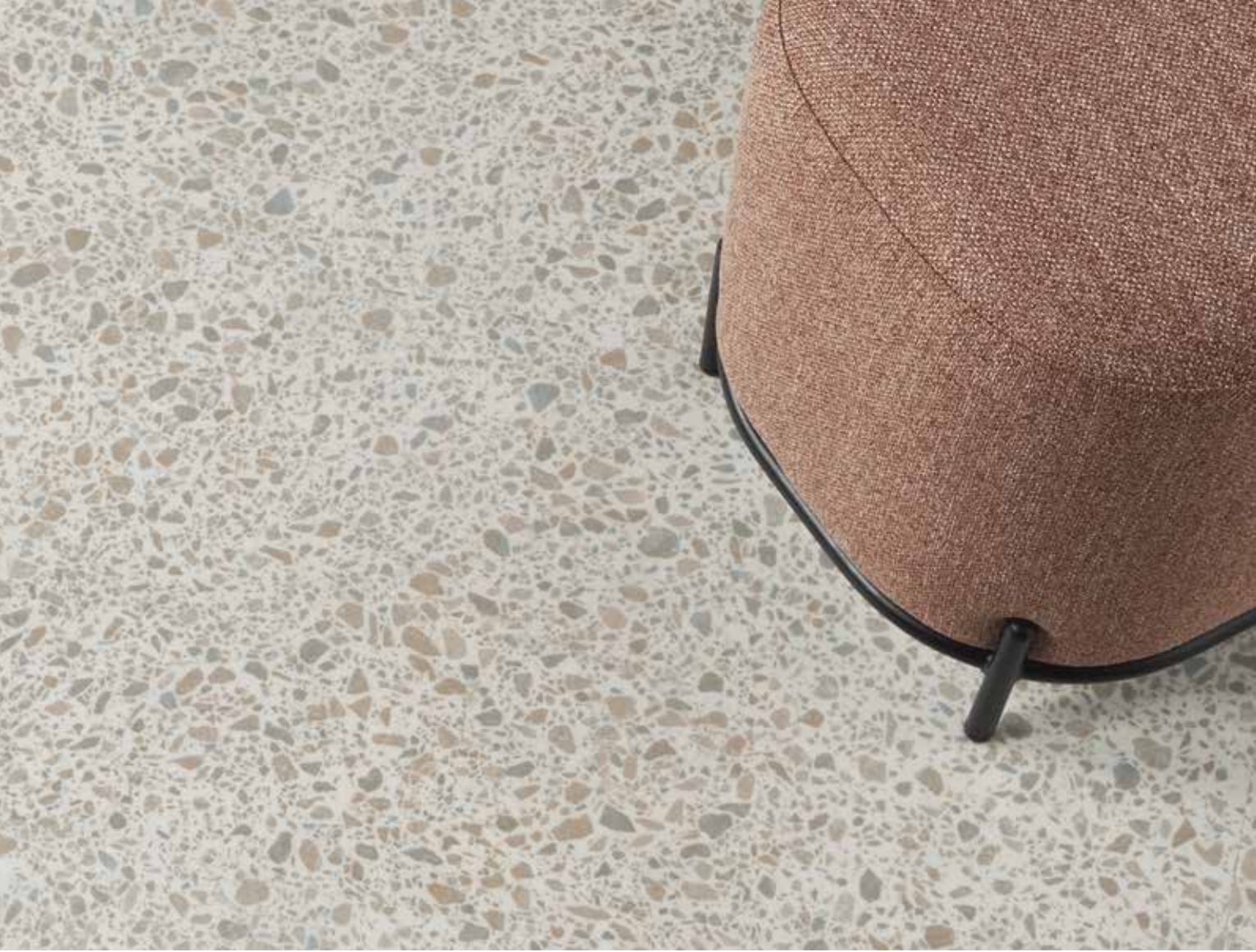
ST557 Palazzo, Rosa