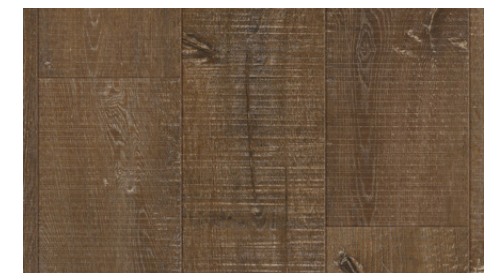
Light Brown PC004