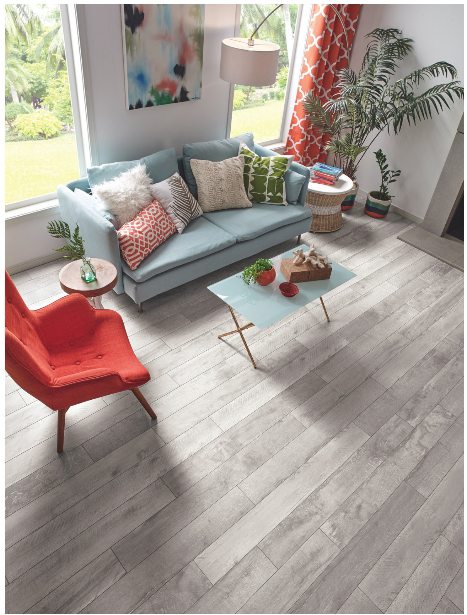
FOREST TREASURE WHITE PC017