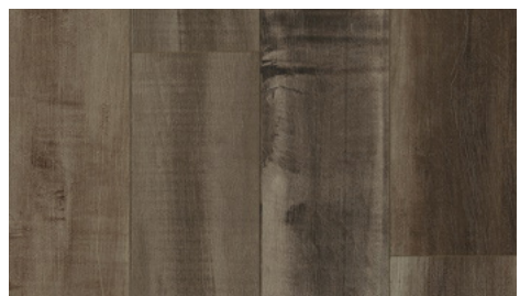
Reclaimed Gray PC009