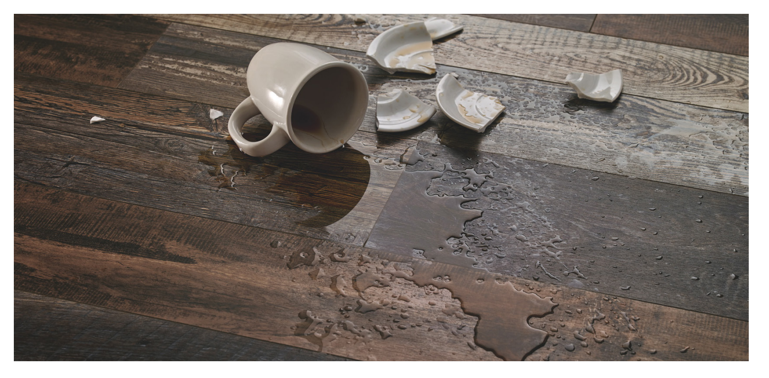
FOREST TREASURE 5.7" width planks