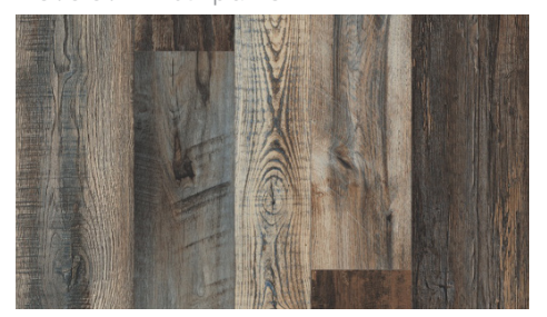
Vintage Multi PC020