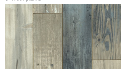
Sky Blue PC012