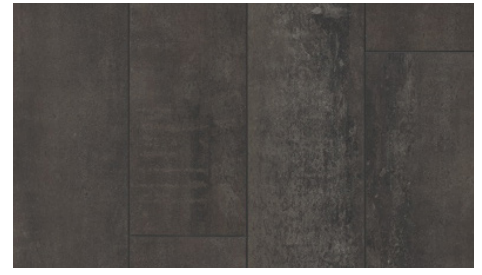
Seascape Gray PC010