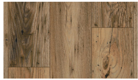
Antique Natural PC002