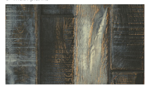
Blue Gray PC011