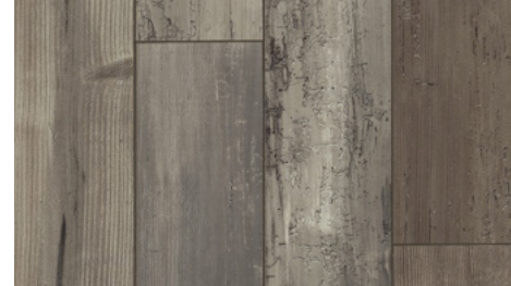
Pier Brown PC013