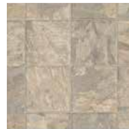
016HI Heritage Steely Blue