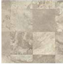
040HI Coastal Waterway Sand Dollar