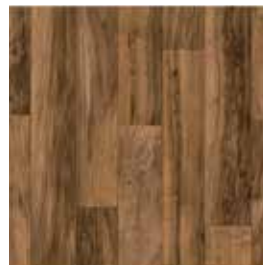
025HI Wisdom Morning Coffee