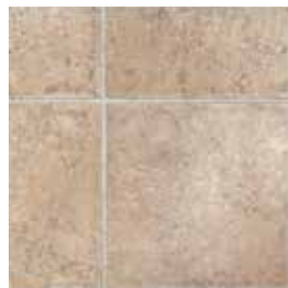
006HI Masterpiece Natural Wheat