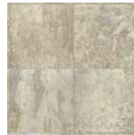
030HI Carved Rock Antiqued Ivory