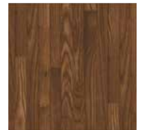
020HI Summer Nights Stout