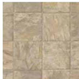
015HI Heritage Mixed Taupe