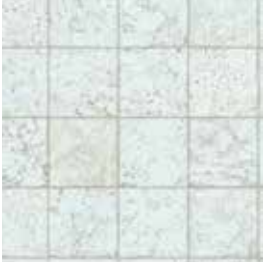
035HI Pacific Stone Ice Blue