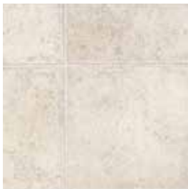
005HI Bridgeton Parchment