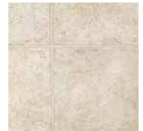
001HI Fireside Toasted Marshmallow