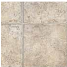
002HI Fireside Falling Ash