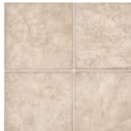
010HI Glenville Creme