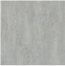
611PM Worn Stone Silver Lining