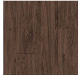
634PM Northumberland Rustic Brown