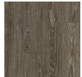
608PM Campground Charcoal