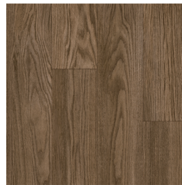
604PM Mountainside Oak White Tail Deer