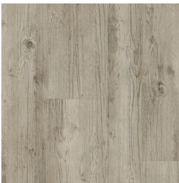
601PM Lakeside Memory Stonewashed