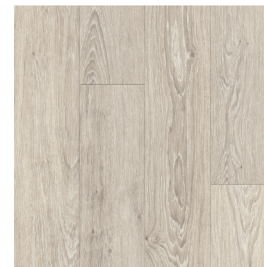
606PM Campground White Pine