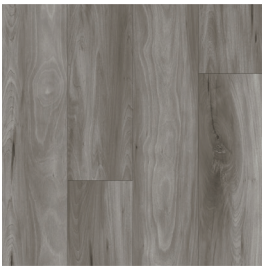
609PM Lustrous Oak Steely Gray