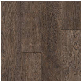
637PM Classic Americano Caramelo