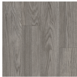
602PM Mountainside Oak Silver Fox