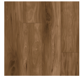
610PM Lustrous Oak Sunsoaked Pier