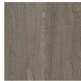
607PM Campground Smoky Haze