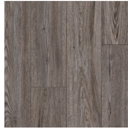
628PM Backcountry Trail Storm