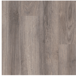
625PM Burr Mill Oak Silver Fox