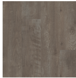
605PM Nostalgia Chestnut Cashmere