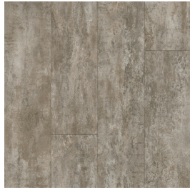
612PM Worn Stone Mud Castle