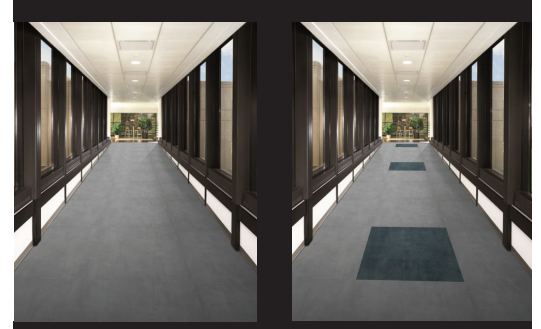
Figure 4. The Gestalt law of continuity can visually reduce the length of a space such as what happens when squares are added to this hallway.

Figure 3. The Gestalt law of continuity can lead us in a specific direction.