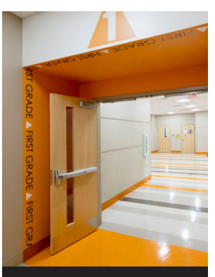
Figure 2. The Gestalt Principle of similarity can tie design elements (e.g. color, shape) together.

Let's explore some examples as it applies to wayfinding. When elements look similar, building occupants naturally group them together as part of a pattern or group. For this reason, designers can use similarity to create a single design element, illustration, or