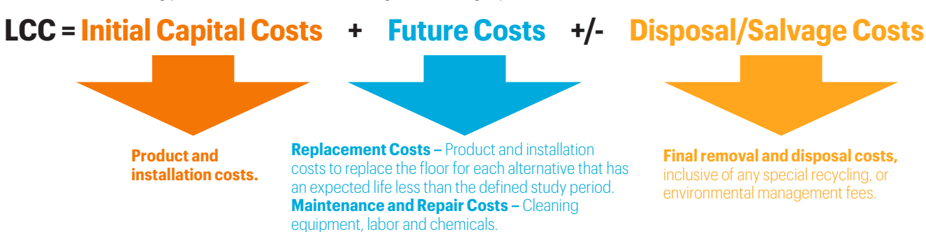
Step 1. Determine the Initial Capital Cost.

The LCC of most flooring products can be calculated using the following equation<sup>2</sup>: