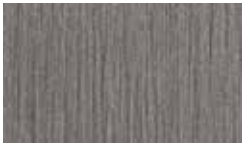
J5262 | J5162 Havana heather