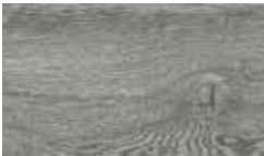
J5216 | J5116 Glendale Oak silver fox