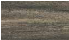
J5220 | J5120 Cornelius Creek sage brown