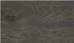
J5202 | J5102 Glen Brook Oak evening shadow