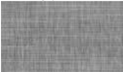
J5250 | J5150 Jace silver gray