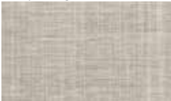
J5251 | J5151 Jace pier beige

+10 ADDITIONAL YEARS of overall warranty coverage by using any Strong System™ subfloor preparation product.