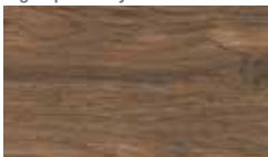
J5210 | J5110 Hightop Hickory caramel cove