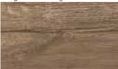
J5240 | J5140 Long Beach Oak golden sand