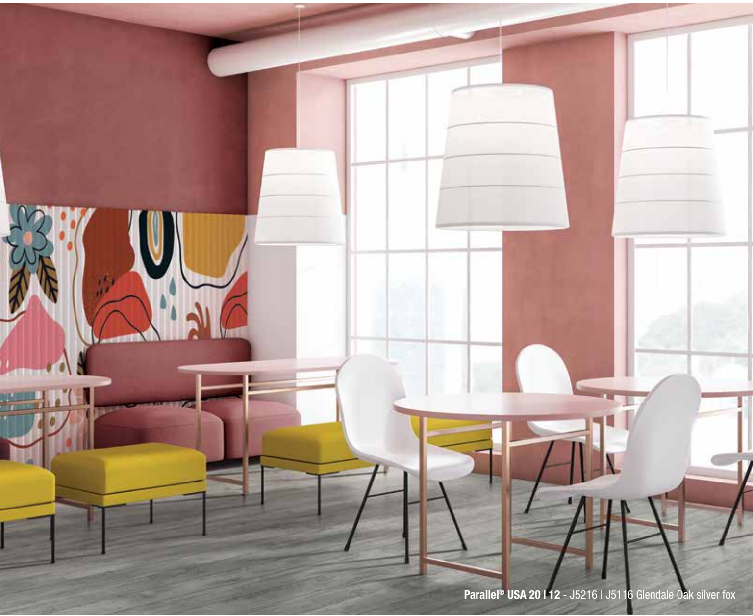
Parallel® USA 20 | 12 - J5216 | J5116 Glendale Oak silver fox