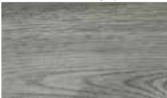
J5217 | J5117 Glendale Oak forest gray