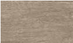
J5215 | J5115 Glendale Oak scotch mist