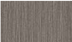
J5263 | J5163 Havana henna