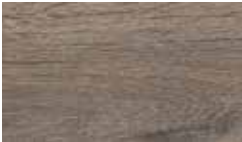
J5203 | J5103 Glen Brook Oak drift sand