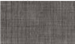
J5252 | J5152 Jace ebony gray