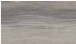
J5255 | J5155 Brushed Essence enchanted