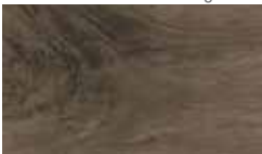
J5245 | J5145 Savannah Walnut endearing