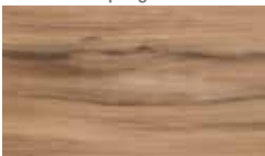
J5225 | J5125 Cottonwood Springs sunset blonde