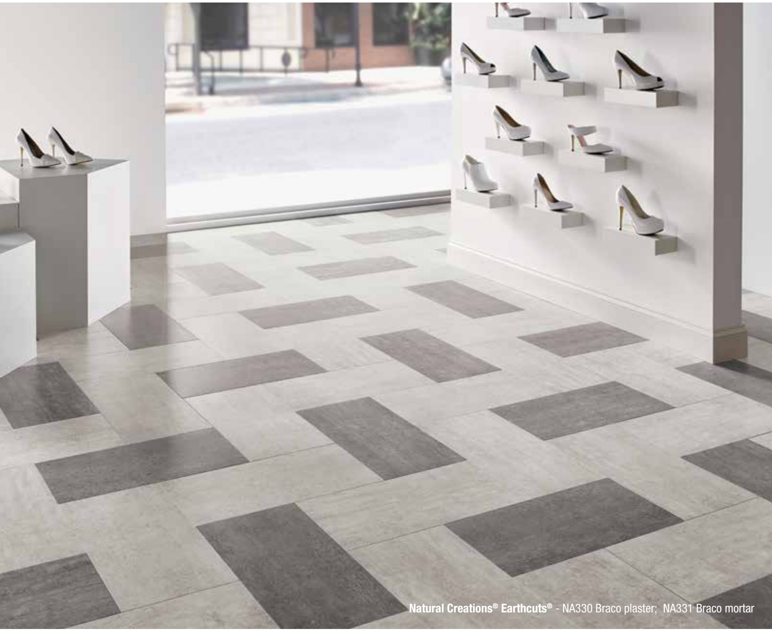
Natural Creations® Earthcuts® - NA330 Braco plaster; NA331 Braco mortar